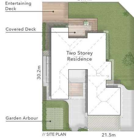
// SITE PLAN

33 Awoonga Avenue BURLEIGH HEADS Block Size 640m 2