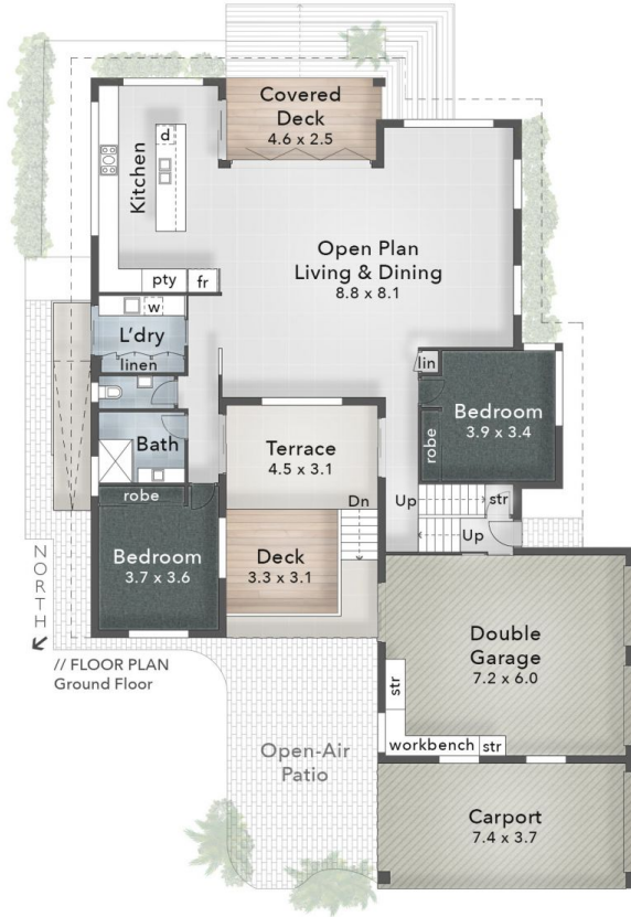
// FLOOR PLAN Ground Floor