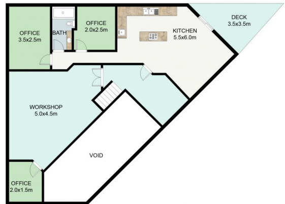
MEZZANINE FLOOR PLAN

This floor plan including furniture, fixture measurements and dimensions are approximate and for illustrative purposes only. Boxbrownie.com gives no guarantee, warranty or representation as to the accuracy and layout. All enquiries must be directed to the agent, vendor or party representing this floor plan.