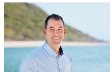
James Borbidge 07 5576 6616