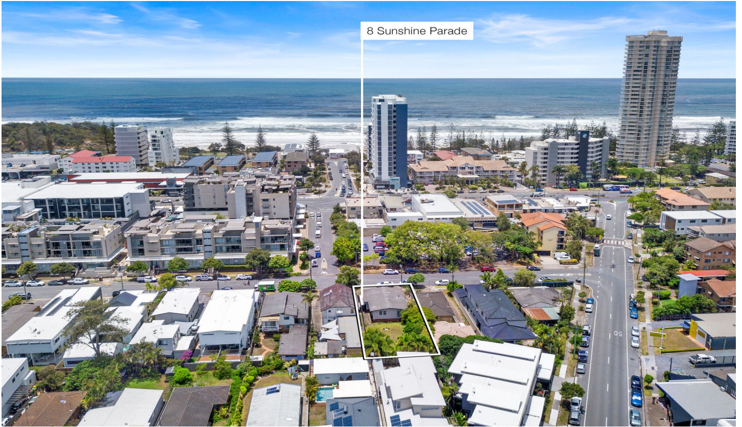
8 Sunshine Parade