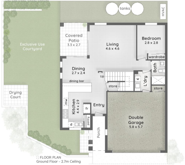
:: FLOOR PLAN Ground Floor - 2.7m Ceiling

SHARED DRIVEWAY ACCESS TO ANDROMEDA PARADE