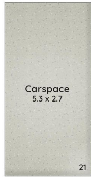
:: FLOOR PLAN Ground Floor